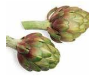
Artichoke Bottom - Quarter